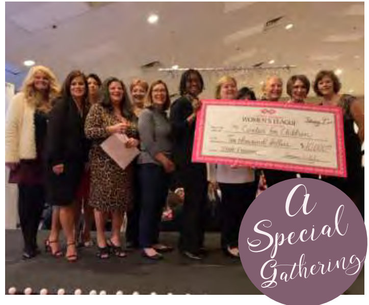
Ceremonial check presentation at the Comedy Club Fundraiser to our 2-year grant recipient, the Center for Children (CFC) with Board members from both SMWL and CFC.